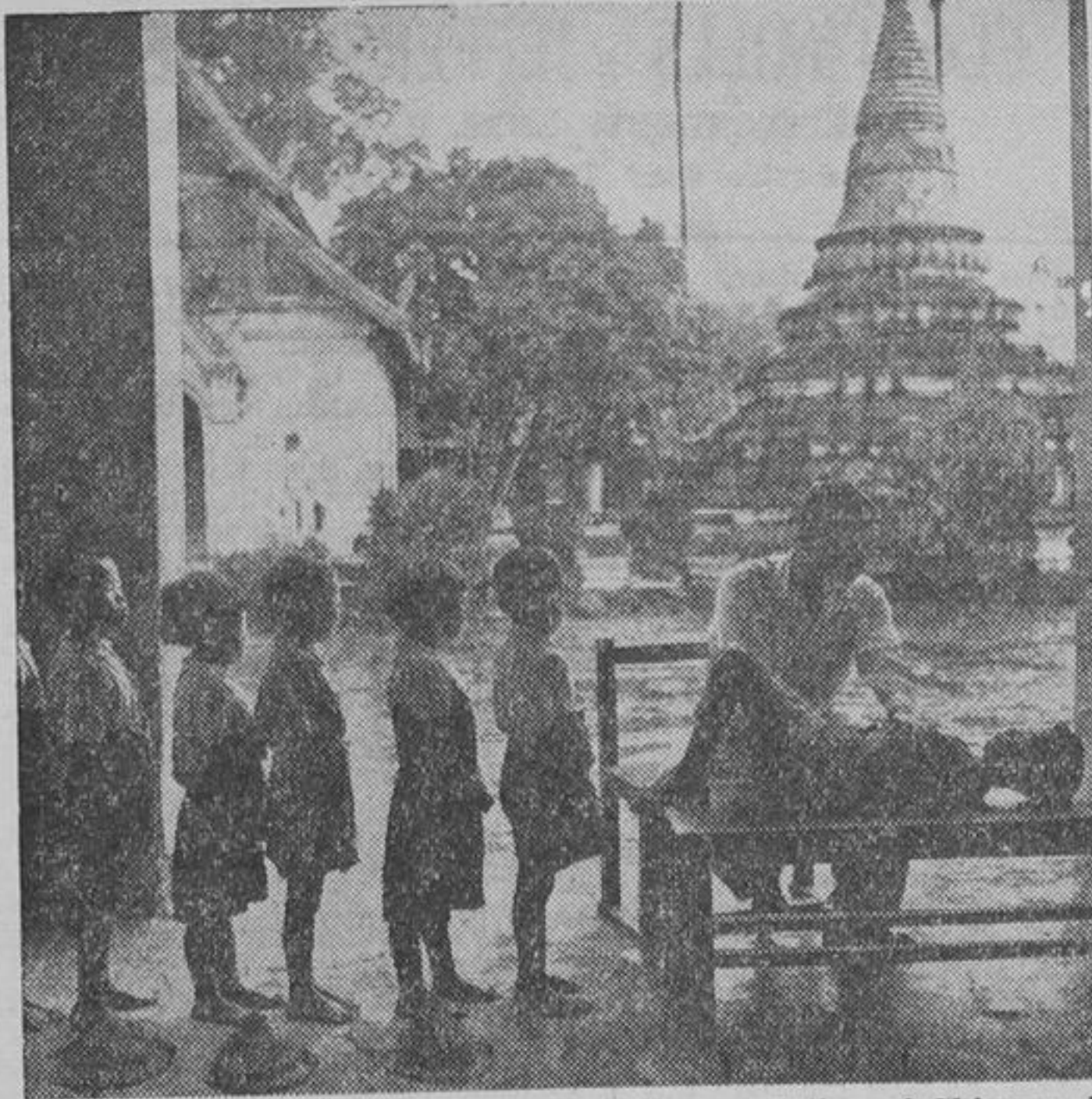
Three years ago 60 to 70 per cent of the population of Chiengmai, in Northern Thailand, was affected by malaria. Since then, with the help of the U.N. World Health Organization (WHO), and the U.N. International Children's Emergency Fund (UNICEF), Thailand has largely succeeded in eliminating the "slow killer" in many parts of the country. Above, a Thai doctor uses a borrowed table from a nearby temple to examine a group of children of that region.