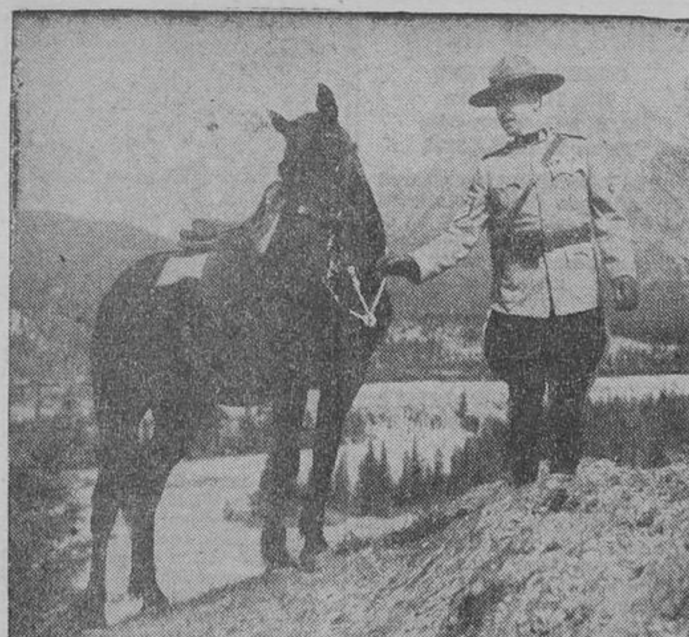
The Canadian Rockies wouldn't be the Canadian Rockies to visitors unless they saw a scarlet-coated Royal Canadian Mounted Policeman and his horse. Here is one of the "Mounties" who is stationed in Jasper National Park with his horse "Blackie" and in the background is multi-colored Pyramid Mountain across the Athabaska Valley from Jasper Park Lodge, a village of log bungalows, operated by the Canadian National Railways. Blending with the mountain scenery, the Lodge offers tourists all the modern facilities of a city hotel.