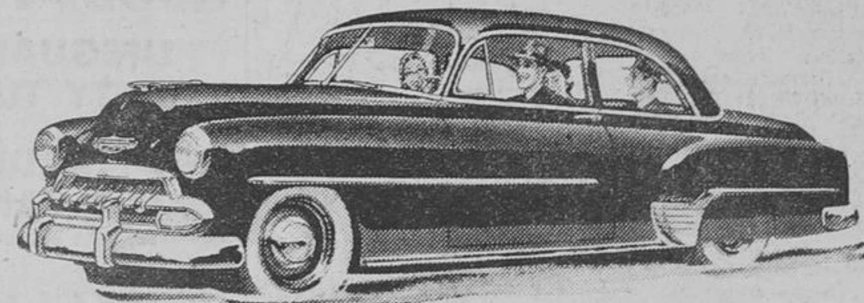
A GENERAL MOTORS VALUE

*Powerglide optional at extra cost on De Luxe models.