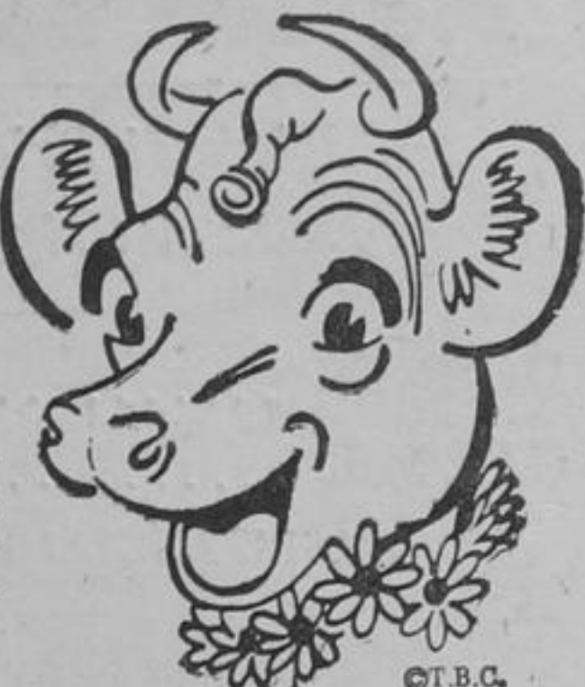
says Elsie the Borden Cow.

Visit Elsie and her little son Beaugard at the CNE. They'll be in their unusual Cowland boudoir with a moo-ving welcome for everyone... especially the kiddies.