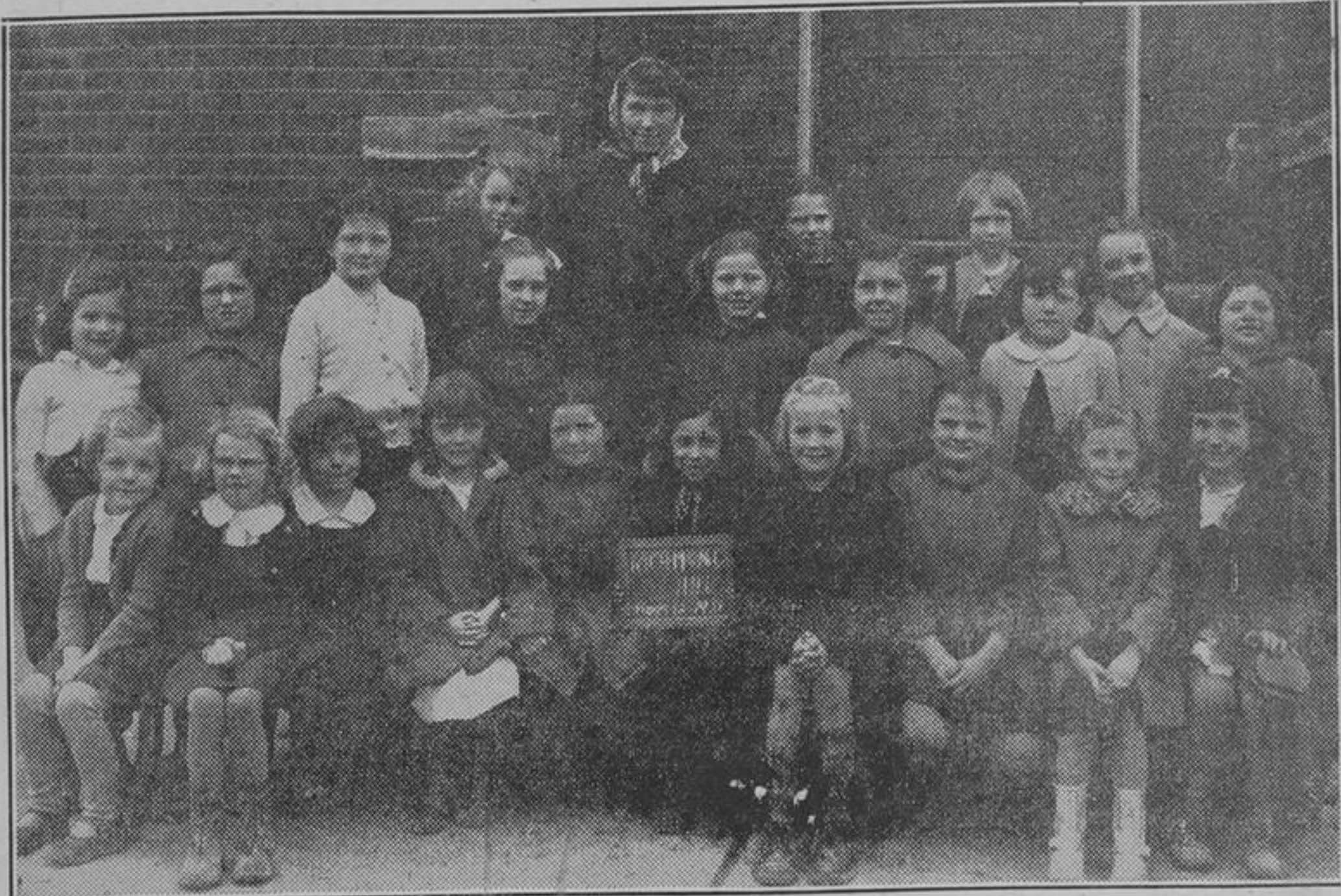
Pictured above are the Grade 1 pupils of Richmond Hill Public School, whose classroom is at the Municipal Hall.