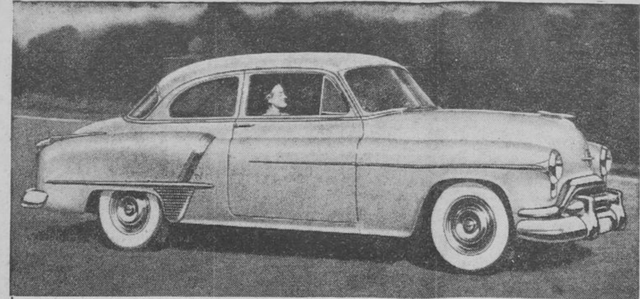
THE NEW 1951 OLDSMOBILE SUPER "88" now in production by General Motors of Canada is night-lighted by a new, wider and roomier body which features clear vision wrap-around windows with consequent greater visibility. The new series is readily identified by the distinctive bright sash moulding which extends diagonally down the rear fender to the gravel shield and also by the high crown rear fenders. The Super "88" is powered by the eight-cylinder "Rocket" engine which develops 135 horsepower. Hydra-Matic Drive is available as an option at extra cost. Shown here is the 1951 Oldsmobile Super "88" deluxe two-door sedan.

*We guarantee the actual count of vitamins in our Chick Starter to be in excess of the requirements recognized by best known authorities. Blatchford Feeds Limited. Richmond Hill Farmers' Supply Richmond Hill - Ontario