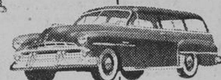
DODGE REGENT Club Coupe