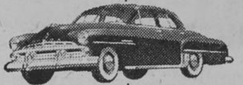
DODGE CRUSADER 4-Door Sedan