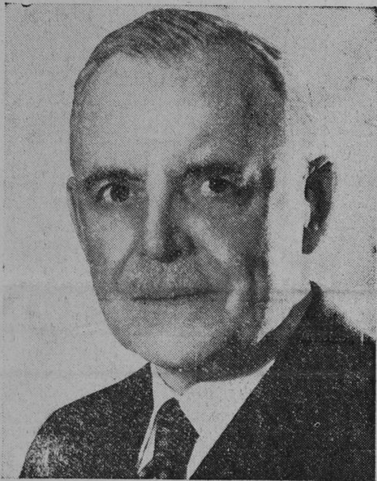
LOUIS ST. LAURENT, Prime Minister of Canada

At the polls on June 27 the voter must ask himself, ahead of anything else, who should be head of the government.