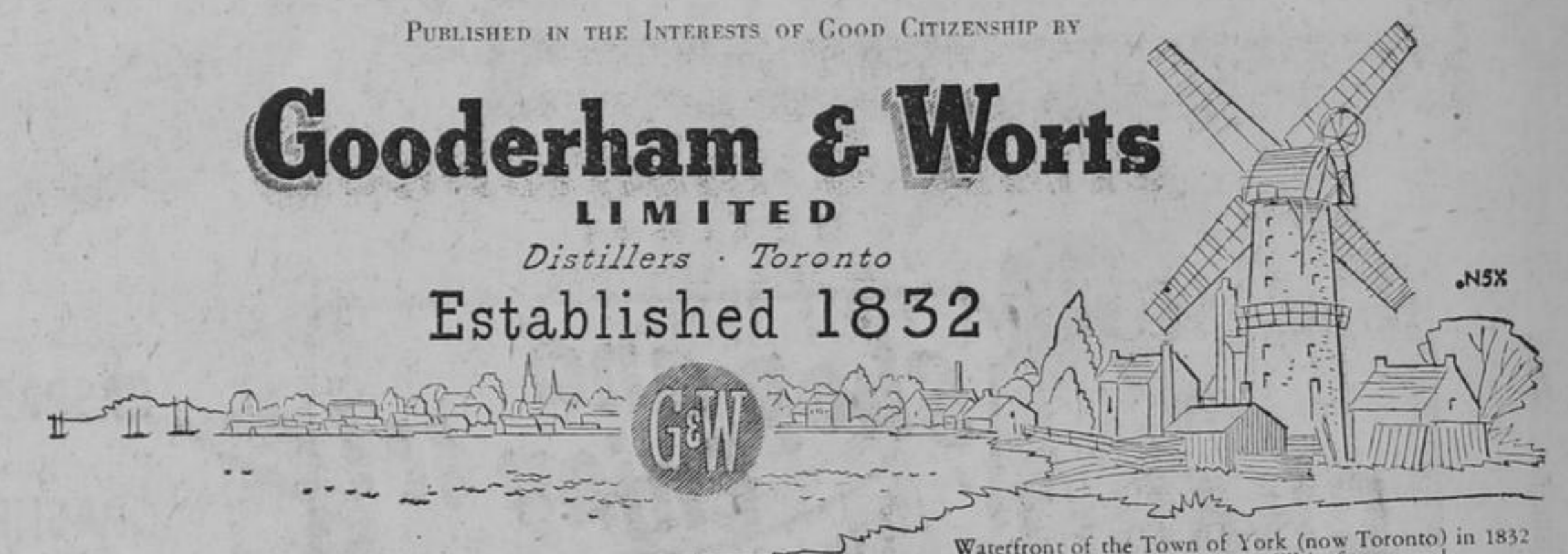
Waterfront of the Town of York (now Toronto) in 1832 Gooderham & Worts Mill in foreground.

PUBLISHED IN THE INTERESTS OF GOOD CITIZENSHIP BY Gooderham & Worts LIMITED Distillers - Toronto Established 1832