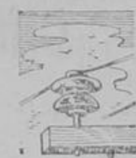
DON'T BREAK INSULATORS

In the meantime, demand for electricity is growing faster than new power plants. Few people anywhere use as much electricity per person as in Ontario. Few have as much to use. Enjoy your low-cost electric power, but use it wisely. Your Hydro Commission is doing everything possible to increase the supply; but it will still be necessary to conserve electricity this fall and winter.