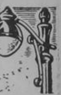
DON'T BREAK STREET LIGHTS

THE HYDRO-ELECTRIC POWER COMMISSION OF ONTARIO