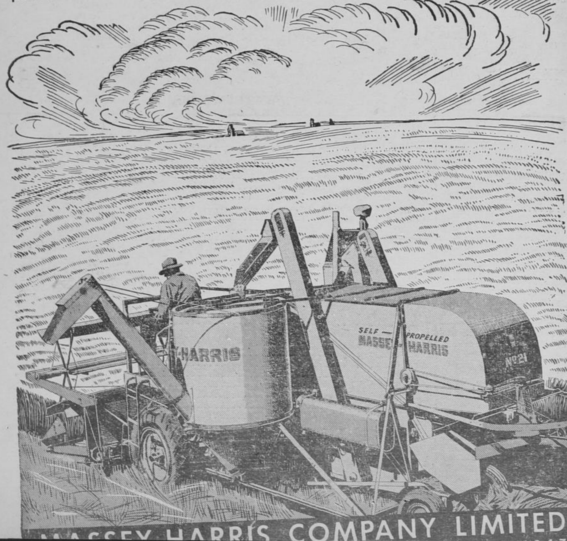
MASSEY HARRIS COMPANY LIMITED

The self-propelled principle introduced in the Massey-Harris Combine opens up a world of possibilities in the future trend of farm machines for the road ahead.