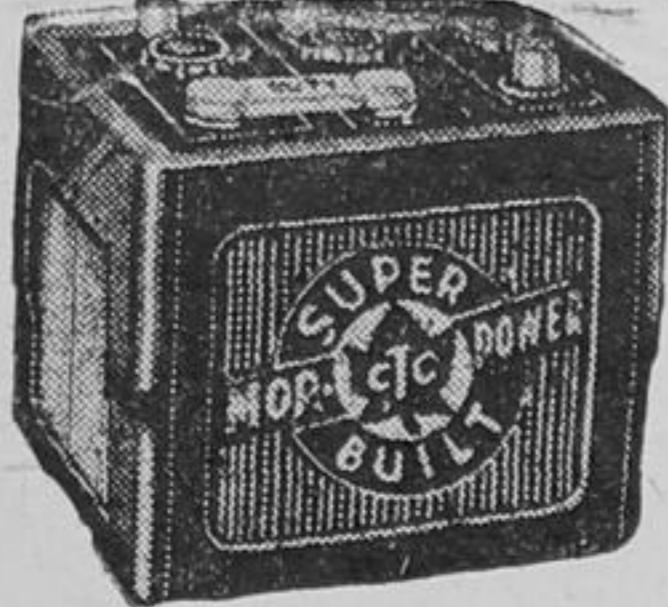
SUPER SERVICE TYPE 2-year service guarantee. Identical to original equipment batteries.

Super Service, 17 plates, 160 amperes, 11 1/4" long, 7" wide, 8 1/2" high. For large models of Buick, Chrysler, Cadillac, Dodge, Franklin, etc. List $24.50