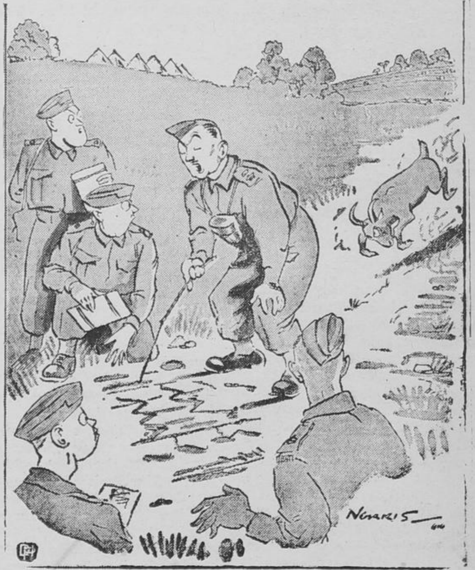
"One point I wish to emphasize, gentlemen — always guard the rear!"