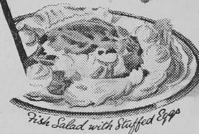
Fish Salad with Stuffed Eggs

Any canned or cooked fish may be used. Combine with diced pickled beets and cold diced potatoes. Garnish with sliced or stuffed eggs and lettuce. Serve with mayonnaise.