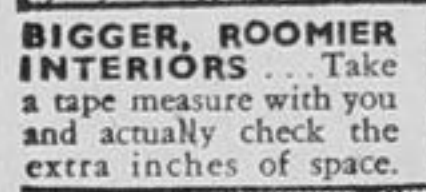
BIGGER, ROOMIER INTERIORS . . . Take a tape measure with you and actually check the extra inches of space.