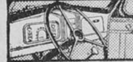
EVERY CONVENIENCE . . . Complete instrument panel and a convenient parcel compartment. Many other attractive appointments.

Twice the beauty . . . with glorified "Body by Fisher" style. Smart and distinguished, from new "diamond" radiator grille to the capacious built-in trunk at rear.