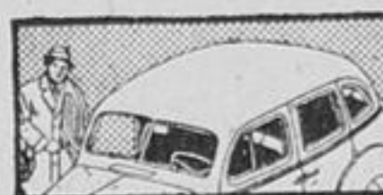
FAMED TURRET TOP . . . Smooth-flowing for smarter streamlining. A single sheet of solid steel, it puts unequalled protection overhead.

The world's smartest, safest, most famous car body . . . Only on Chevrolet in the Lowest Price Field!