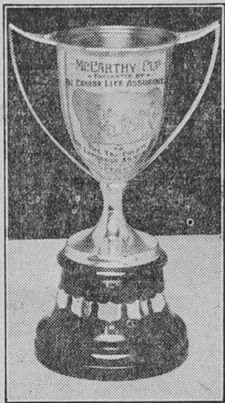
GOING NORTH FOR THE WINTER

The McCarthy Cup, representative of the Tri-County League championship, which may spend the coming winter in Huntsville. The Hawks, winners of the northern section, defeated Caledon East, winners of the southern section, in the first of the final games Monday night by a score of 9-7 in Orangeville. The return game will be played in Huntsville Friday night when it should be easy for the Huntsville boys to repeat the performance. Since the cup was first donated it has been won twice by Orillia, once by Bradford and twice by Richmond Hill. If the coveted mug now travels to the north country it should tend to give new impetus to the game in that section.