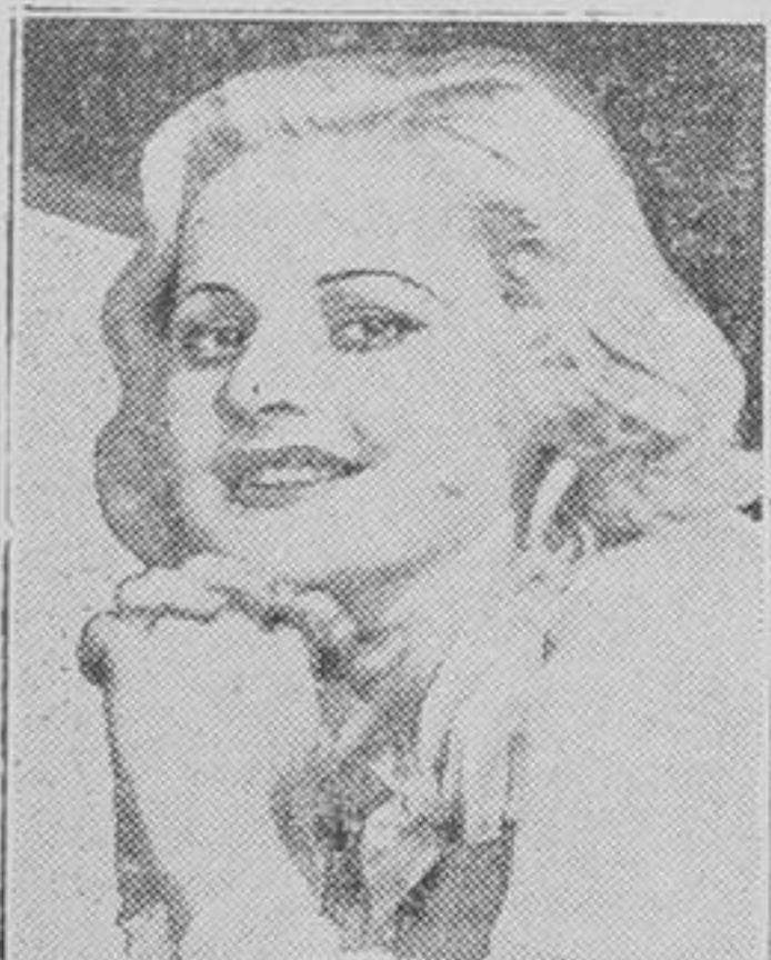
One of the attractive young ladies in the gorgeous musical "Dames" showing at the Capitol, Thursday, Friday, Saturday this week.