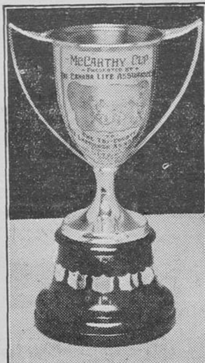
McCARTHY CUP Emblematic of the championship of the Tri-County Lacrosse Association which Richmond Hill Young Canadians are hopeful of winning in to-night's final lacrosse fixture.