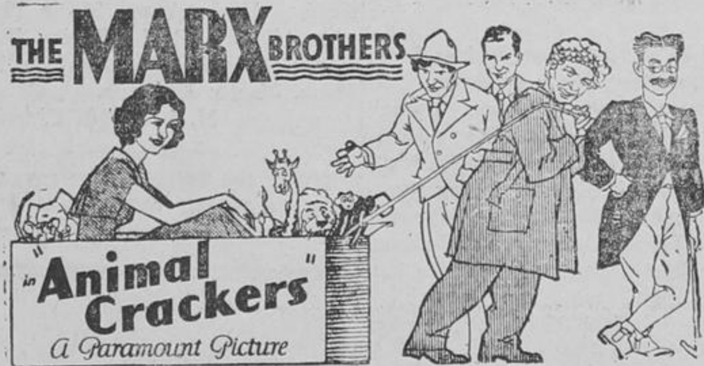
The Funniest Hit On Earth.

Saturday, Monday, Tuesday NOV. 15, 17, 18 COMEDY Fiddling Around NEWS CONTINUOUS SHOW SATURDAY 1.30 to 11.30