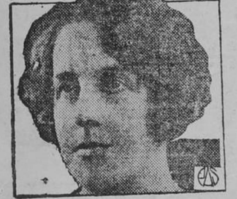
Miss Ruby M. Ayres, author of "Broken," acclaimed by critics as England's foremost woman novelist.