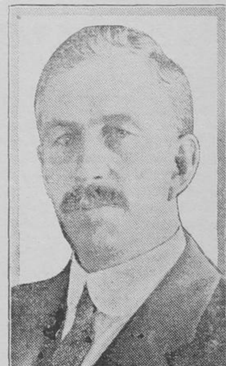
HON. T. A. CREARAR