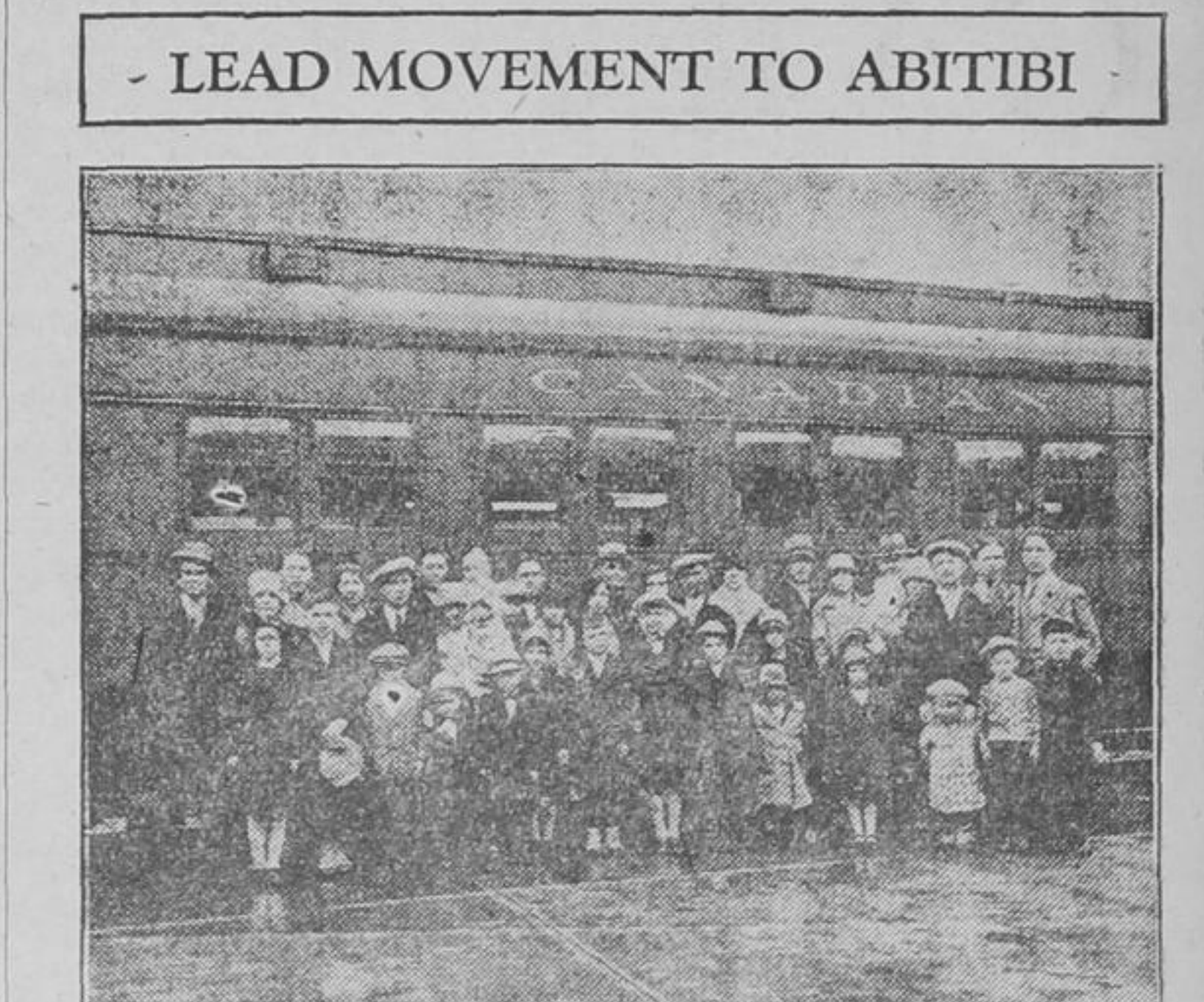
The first party of French-Canadian families moving northward from the New England States to make new homes for themselves in the Abitibi region of Northern Quebec. Party photographed at Quebec as they journeyed from Biddeford, Maine, to their new homes under the auspices of the Canadian National Railways Colonization Department.

Dr. Alexander Graham Bell's fame, strange to say, does not rest altogether on his invention of the telephone. At a recent meeting of Telephone Pioneers that wonderful blind woman, Helen Keller, stone deaf and at one time dumb also, spoke of her memories of Alexander Graham Bell. "You who see and hear may not realize that the teaching of speech to the deaf—even imperfect speech like mine—is one of the divinest miracles of the nineteenth century. No one did more to produce this miracle than Dr. Bell. It is typical of Dr. Bell's interest in the deaf that when he was awarded the Volta prize for the achievement of inventing the telephone he devoted the proceeds, a substantial amount of cash, entirely to a fund to promote teaching the deaf to understand the world about them. "The world knows of his study of aeronautics and his belief in the practicality of air travel. On the occasion of the opening of the transcontinental telephone line he said to me, 'Some day aviation will bridge the gap from the Pacific to the Atlantic and make it possible for Mr. Watson (who was speaking from the Pacific) to 'come here' by actually travelling the distance from San Francisco to New York in a non-stop flight! "I have never known another man with Dr. Bell's many-sidedness and charm or anyone with such wide enthusiasm concerning the interests of other people." Helen Keller (seated) and her teacher are shown above; also Dr. Bell and his sister on their last visit to the Bell Homestead at Brantford.