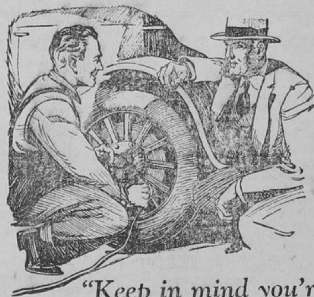
"Keep in mind you're Riding on Air!"