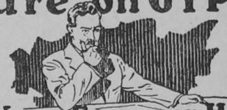
Figure on GYPROC