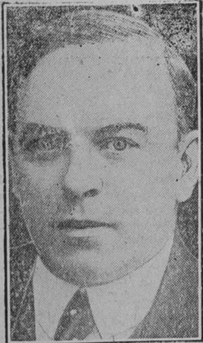
Rt. HON. W. L. MacKENZIE KING Prime Minister and Government leader whose program of legislation for the session of parliament which opened today holds much of a constructive nature and will probably foretell further tax reductions for the people of Canada.