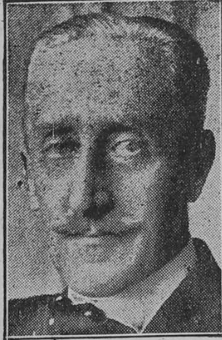
VISCOUNT WILLINGDON Governor General of Canada who will read the speech from the Throne at the opening ceremonies to-day.