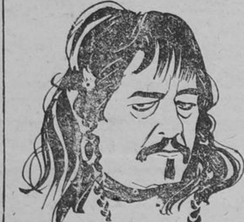
MARC McDERMOTT in "THE ROAD TO ROMANCE"

On Thursday morning Oxford and Cheviot sheep and Berkshire and Chester White swine will be placed with Hampshire, Southdown and Leicester sheep and Yorkshire swine in the afternoon. On Thursday evening the market Shorthorn cattle will be placed in the new ring. Market sheep and swine classes come in the new ring on Friday morning and afternoon with market Angus and Hereford cattle in the evening. The Percheron horses will be judged in the same ring on Saturday morning and afternoon, and the Grand Champion Steer will be placed at one o'clock on the same day.