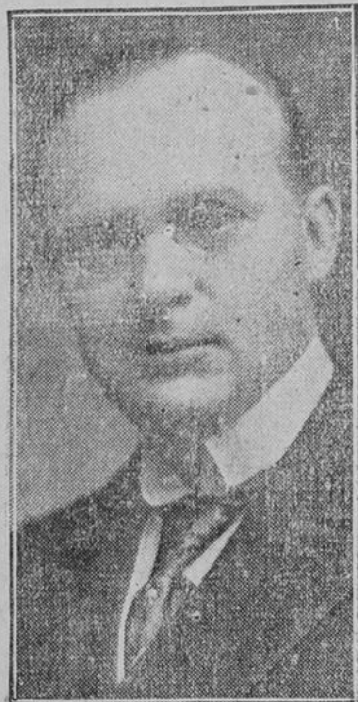
THE NEW CONSERVATIVE LEADER

Sheppard's Shoe Store 2537 YONGE STREET, NORTH TORONTO HUDSON 1485