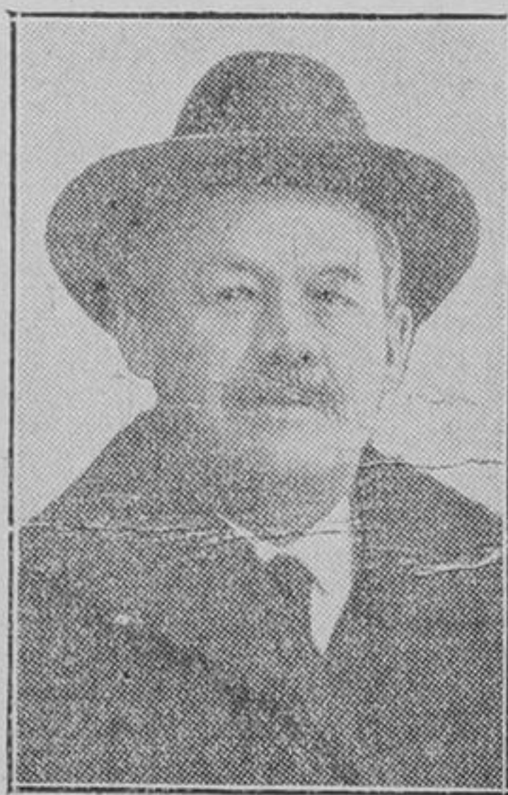
HONORED BY KING Dr. Wilfred T. Grenfell, the noted medical missionary of Labrador, upon whom His Majesty the King has conferred the insignia of Knight Commander of the Order of St. Michael and St. George.

Correct this sentence: "When I'm drunk," said he, "I don't seem such an ass as that fellow."