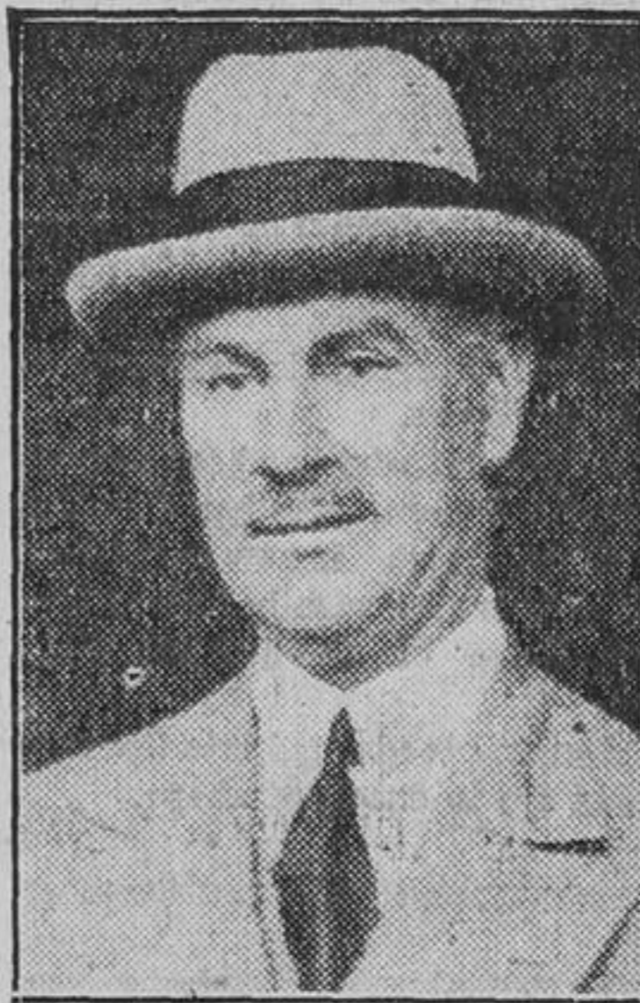
NEW BRITISH DOMINION Sir Edward Grigg, Governor of Kenya Colony, has arrived in London to discuss a plan to unite the colonies of Uganda, Tanganyika, Rhodesia, Nyassa and Kenya into a self-governing federation on the African or Canadian plan. This will add a new Dominion to the British Empire.

A butter merchant felt that he had given his wares the strongest possible recommendation when he hung this placard on a tub of butter: "Superior butter 6d. per pound. Nobody can touch it."