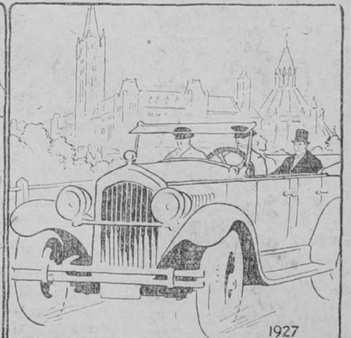
1927 VISCOUNT WILLINGDON OUT FOR A SPIN