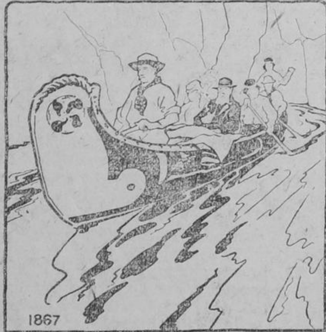
1867 VISCOUNT MONCK ON A PLEASURE JAUNT