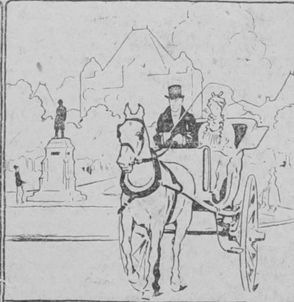
A STYLISH TURN-OUT