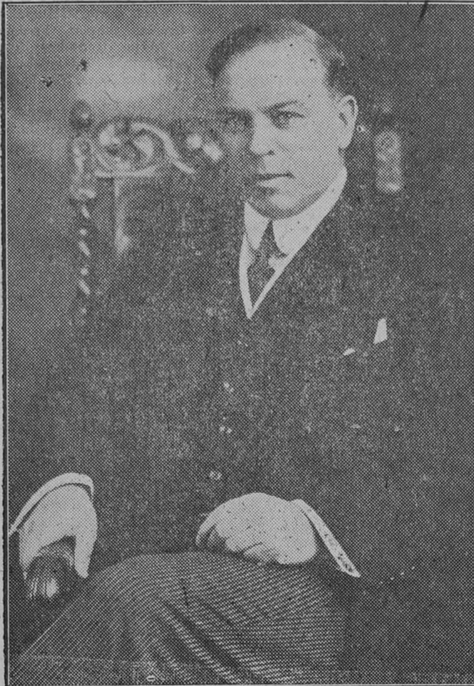
Rt. Hon. W. L. Mackenzie King Present Prime Minister of Canada.

The Dominion of Canada as it came into being on July 1st, 1867 was the outcome of an endeavor by men of diverse temperaments, racial origins, religious and political faiths, to serve the ideal of nationhood. The Union of Upper and Lower Canada with Nova Scotia and New Brunswick, which formed the Canada of the Fathers of Confederation, was but the first-fruits of this endeavor. As one by one other provinces became part of the Dominion—Manitoba in 1870, British Columbia in 1871 and Prince Edward Island in 1873—the same spirit of unity, the same ideal of nationhood were manifest, until in 1905 Saskatchewan and Alberta newly created out of the territories of the middle West, brought to completion the federation of provinces from sea to sea. The vast territories and the silent spaces that sweep northward into the unknown speak more eloquently than words of boundaries still undefined in a land that is limitless in its possibilities of further development and growth.