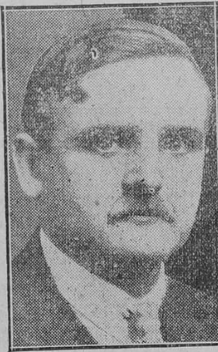
PLANS OTTAWA TO LONDON FLIGHT