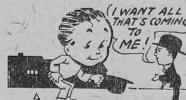
HATS OFF TO THIS MAN!