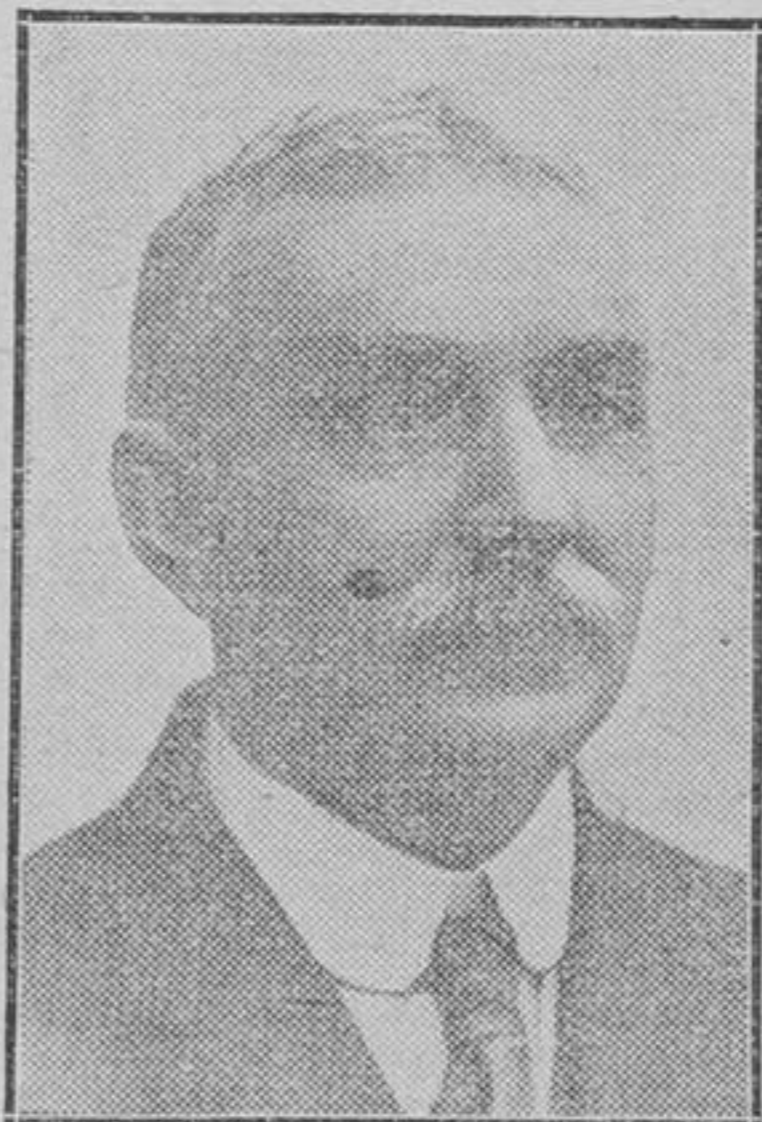
SIR PATRICK McGRATH

Seeds can be sown in the open ground toward the end of May, sow in a well prepared trench four to six inches deep, fine soil on top to plant seed which should be just covered, thin out as above, and graduate earth up as they grow. Keep all the smallest plants to themselves because they are most likely to be the choicest of them all so it is reasonable under the circumstances to take more care of them. Plant two feet apart in rows and the rows three to four feet apart. Lovers of flowers realize their success much depends on forethought, foresight and good judgement.