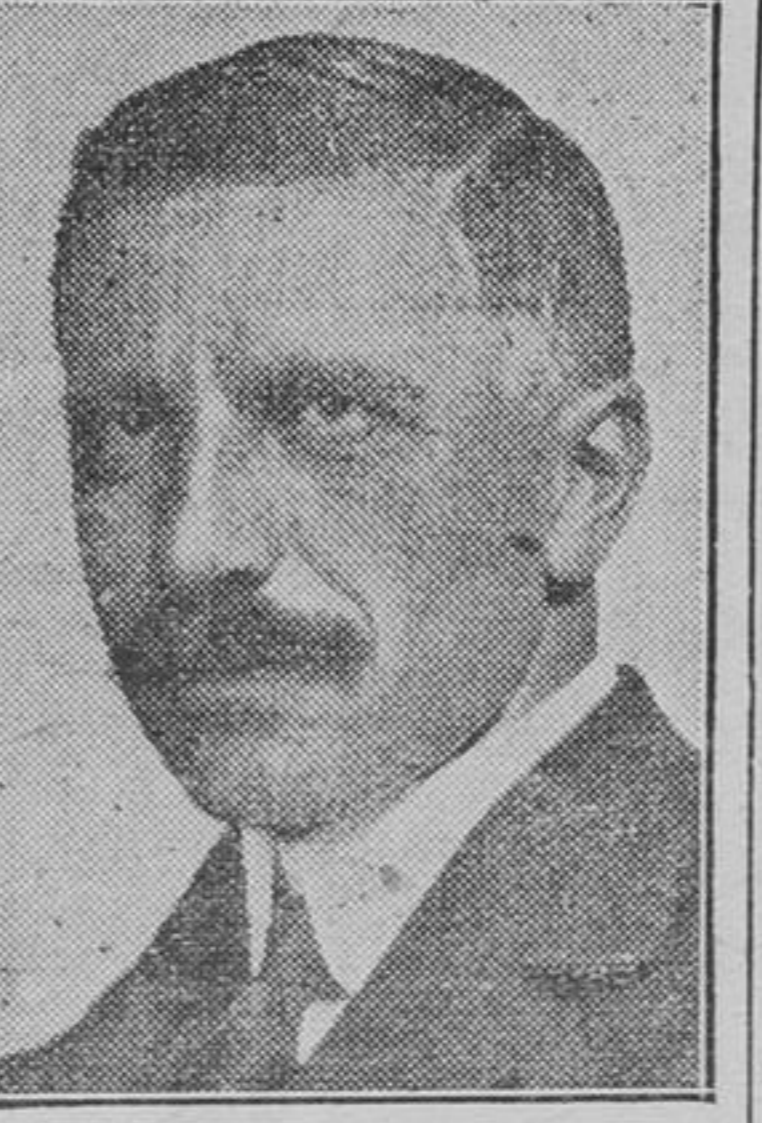
LABRADOR MISSION NEEDS FUNDS

Note—Commencing May 1st, Sunday school each Sunday at 2 o'clock and service each evening at 7 o'clock.