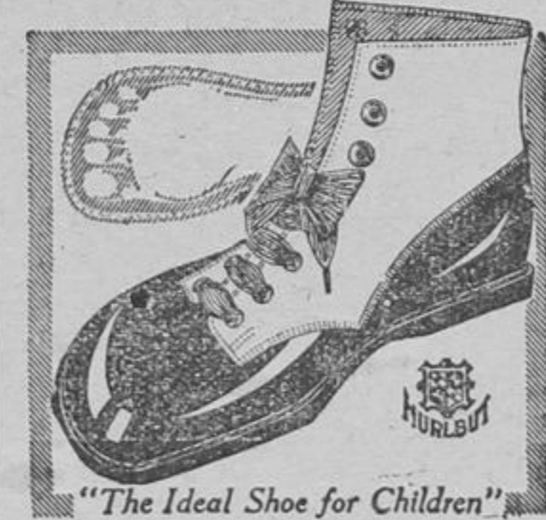
"The Ideal Shoe for Children"

The attendance was unusually large showing the keen interest that is being taken in the meetings. Those attending the meeting received a very great deal of useful information. A social hour was then spent by all.