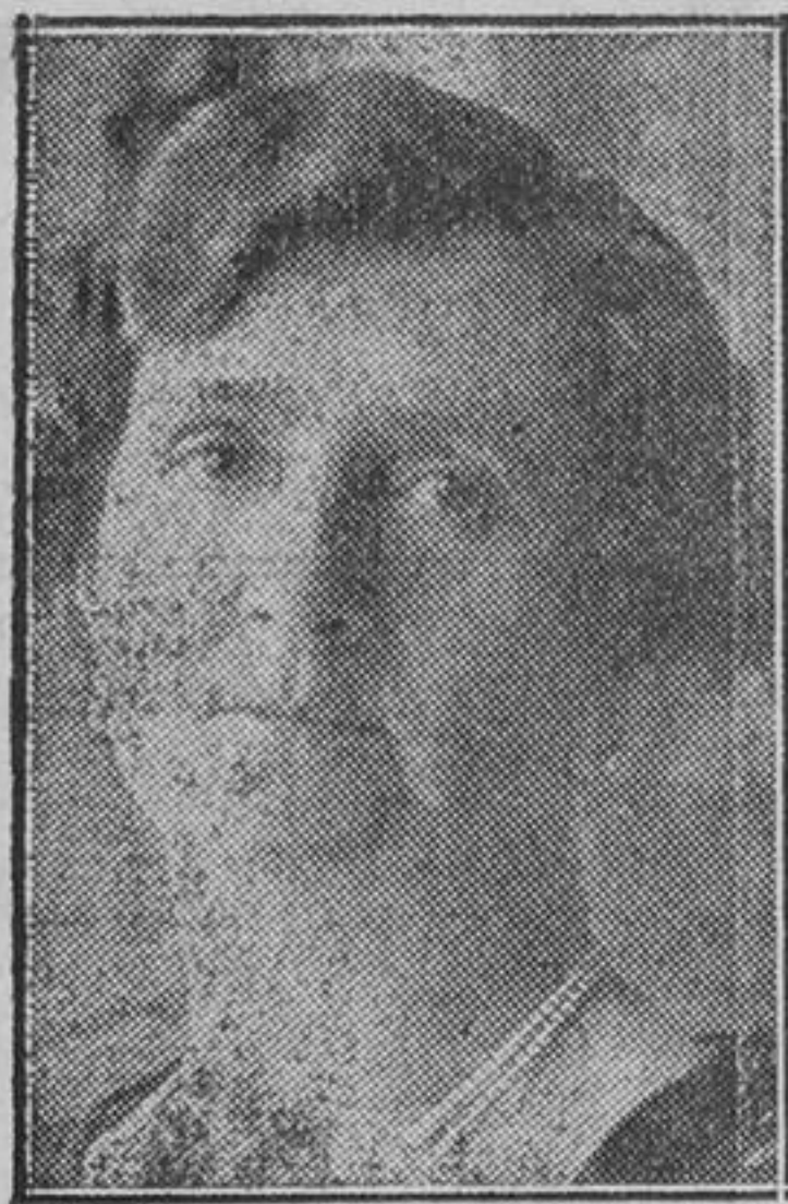
LADY WILLINGDON Rideau Hall's new hostess will em- bark upon a season of exacting so- cial duties early in December, with the opening of Parliament. This cut is from the most recent photo- graph of Lady Willingdon.