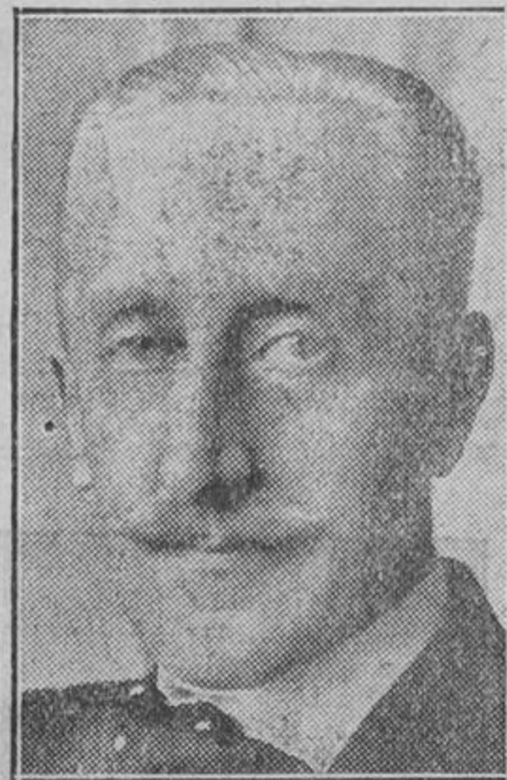
VISCOUNT WILLINGDON Latest picture of the Governor- General who will deliver the Speech from the Throne at the opening of Parliament, Dec. 9.