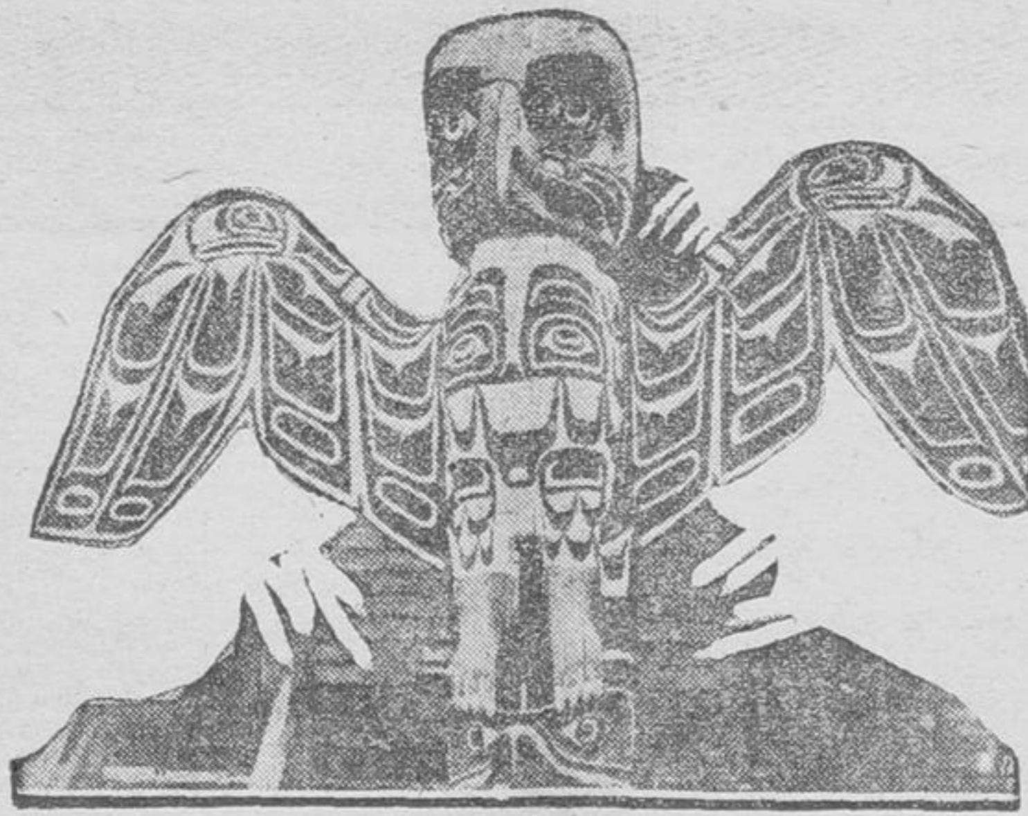
Unusual British Columbia totem pole, distinctive because of the bird-like wings attached to the body. It stands in Alert Bay.

Who, then, would have been a "William de la Rowden" or a "Herbert atte Rayden" in that picturesque period of the Middle Ages when family names were being formed and part of the population of England spoke Norman-French and another part clung desperately to its Anglo-Saxon tongue? The "den," as the word was used by the medieval English, did not indicate so much a lair of wild animals as a sheltered and fenced spot for domesticated or herded animals. The "ray" or the "row" was simply the roe. The men in question would be those who lived near, had charge of, or worked in the roe-den.