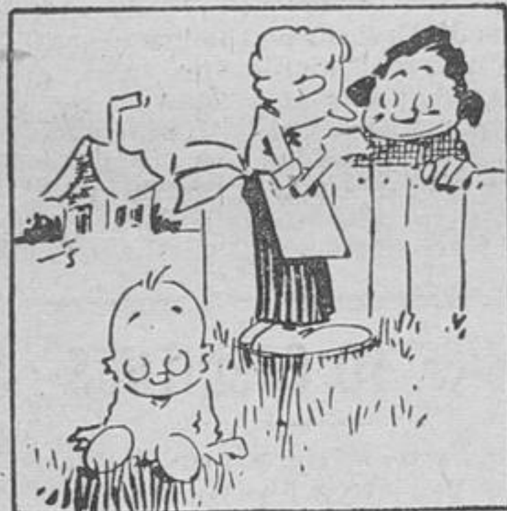
Grounds of Divorce.

Baby's Own Tablets are sold by medicine dealers or by mail at 25 cents a box from The Dr. Williams' Medicine Co., Brockville, Ont.