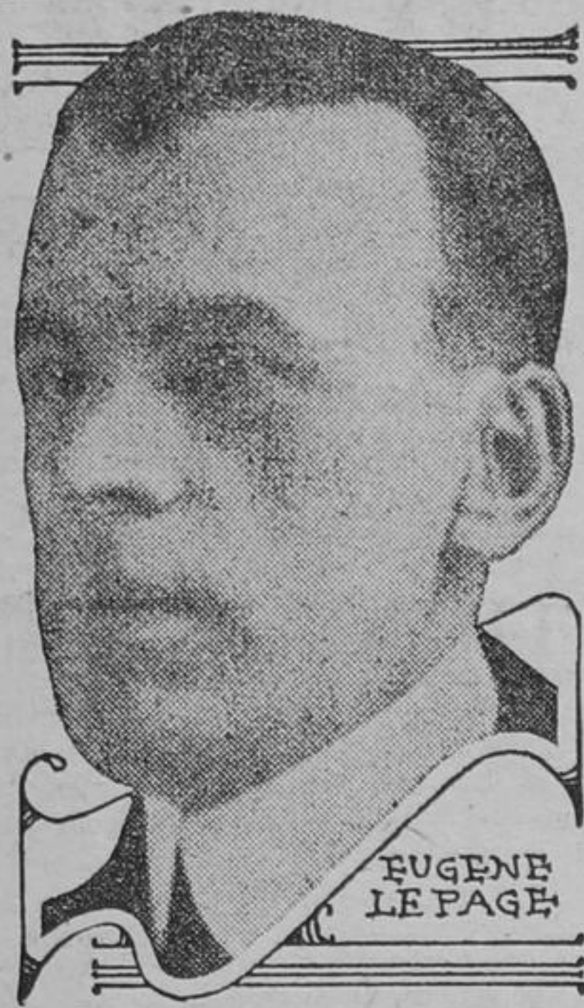
Tanlac Vegetable Pills For Constipation. Made and Recommended by the Manufacturers of Tanlac.

Tanlac is for sale by all good druggists. Accept no substitute. Over 40 million bottles sold.