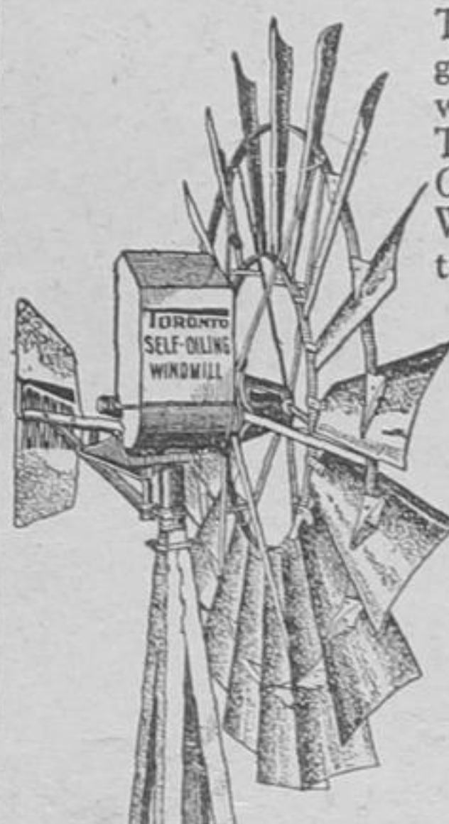
The "Toronto" Tower will stand for a lifetime because it is the heaviest, strongest and best-braced one built for any windmill.

There's no piece of farm equipment that gives so much service over so long a period with so little attention as a good windmill. That's why I recommend the Toronto Self-Oiling Windmill so highly. Lots of Toronto Windmills have given from eighteen to twenty years' service with practically no attention outside an occasional oiling and are still operating satisfactorily every day.