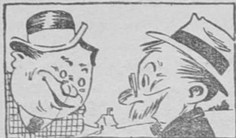
A Volstead Chance.

The safe way to send money by mail is by Dominion Express Money Order.