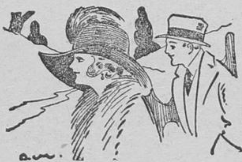
The Magic Touch.

One such glimpse of wild life as that is worth many a day of effort. You can remember such a picture with pleasure long after you have forgotten things that are far more "important."