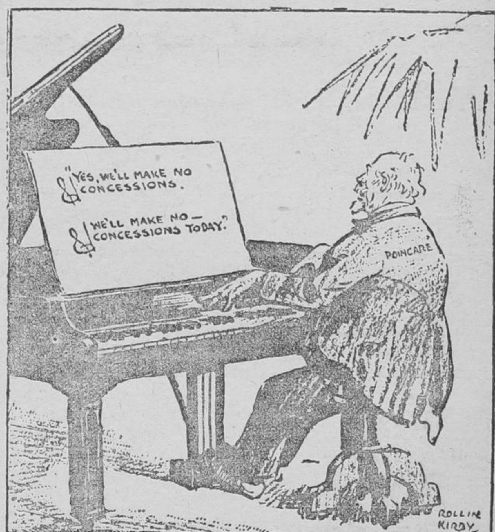
GETTING A TRIFLE STALE

Don't criticize every new thing that the schools are attempting. Consider where your business would be if you still used the same methods and the same equipment that were used "when you were a boy."