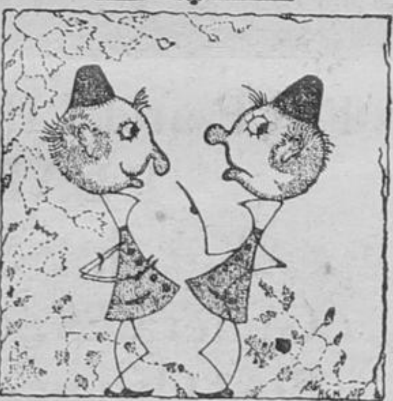
No One Knows.