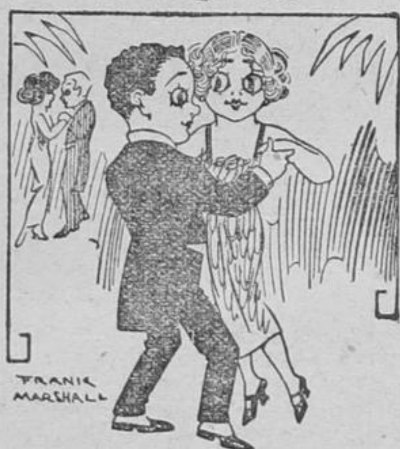
Going the Rounds