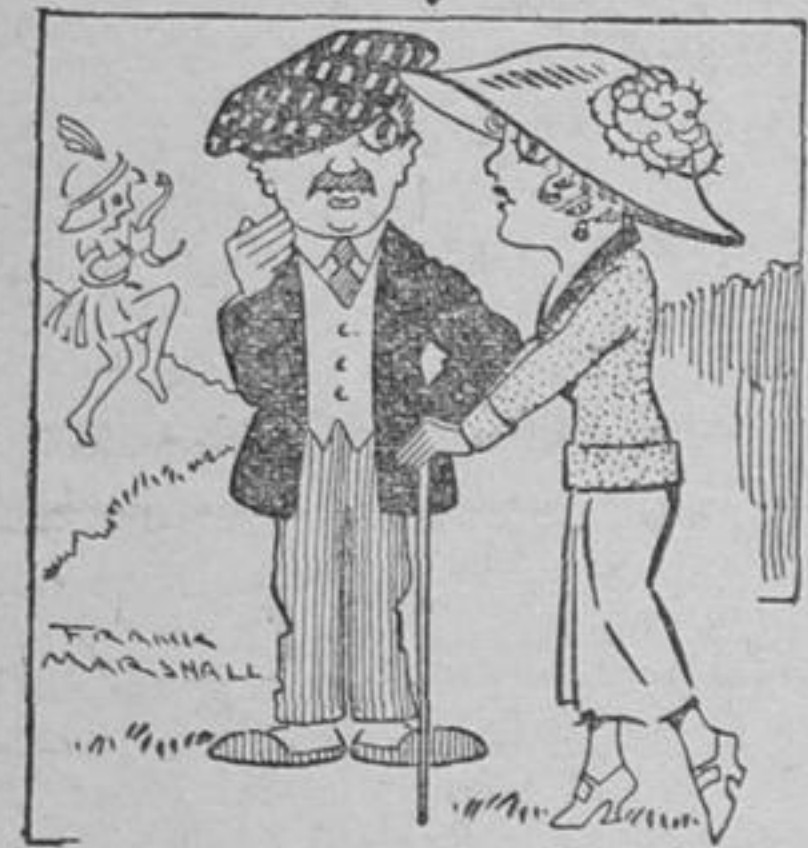
Not Shaky Enough

If you are suffering from any condition due to poor, watery blood, or weak nerves, begin taking Dr. Williams' Pink Pills now, and note how your strength and health will improve. You can get these pills through any dealer in medicine, or by mail, at 50 cents a box from The Dr. Williams' Medicine Co., Brockville, Ont.