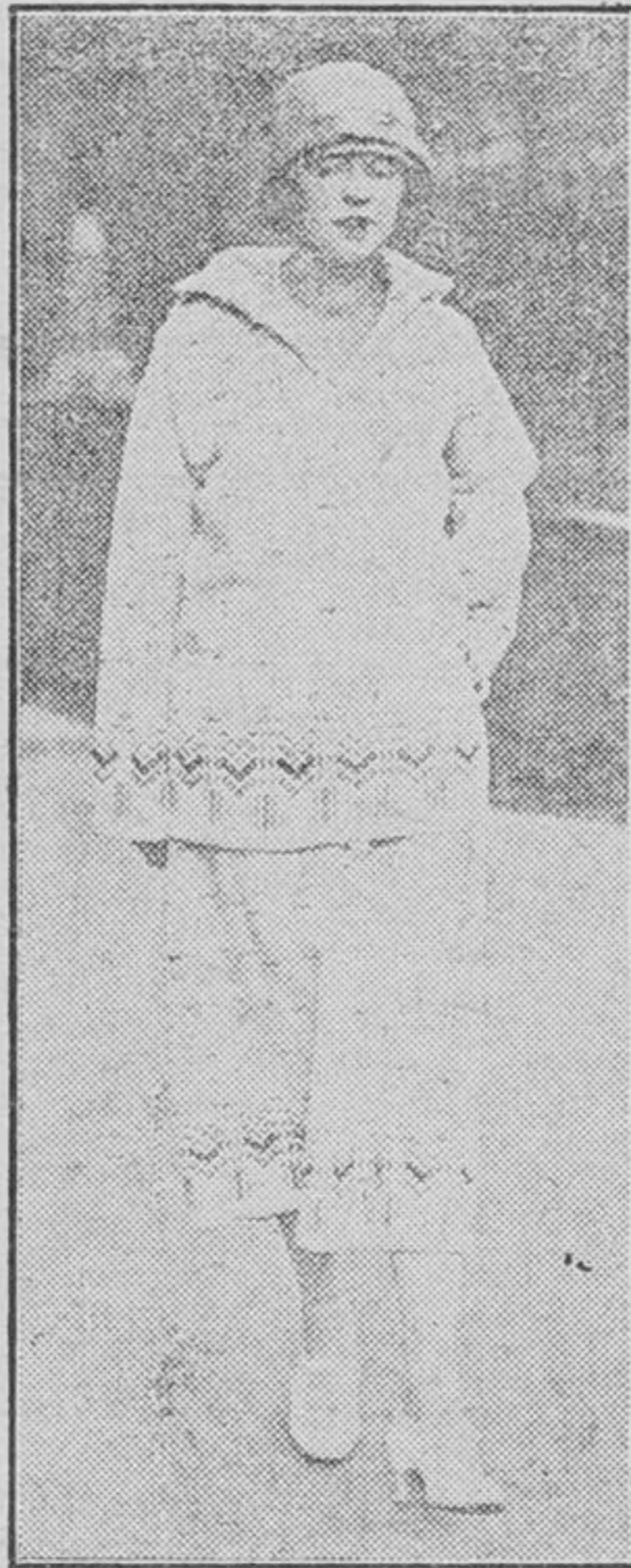
A Pretty Style for Spring.

In the Famous Vauxhall District Bow River Irrigation Project An especially good location for mixed farming and dairying. Splendid opportunity for young men now living in districts where good land cannot be bought at reasonable prices. THIS IS NOT PIONEERING , the first 10,000 acres are fully settled and another 10,000 acres now ready for settlement; maximum distance from railroad, seven miles. Good roads, telephones and schools. Easy payments, extending over 18 years. This is the Best Land Buy in Alberta Write for further information to CANADA LAND AND IRRIGATION COMPANY, LIMITED Medicine Hat, Alberta