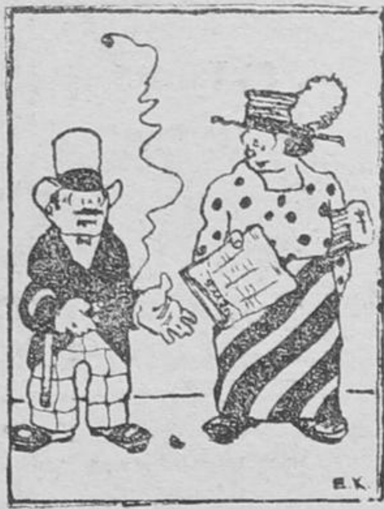
Doing His Part.

"The papers say there would be no panics if people only had confidence in the banks."