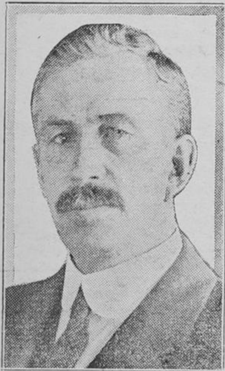
Hon. T. A. Crerar Leader U. F. O.