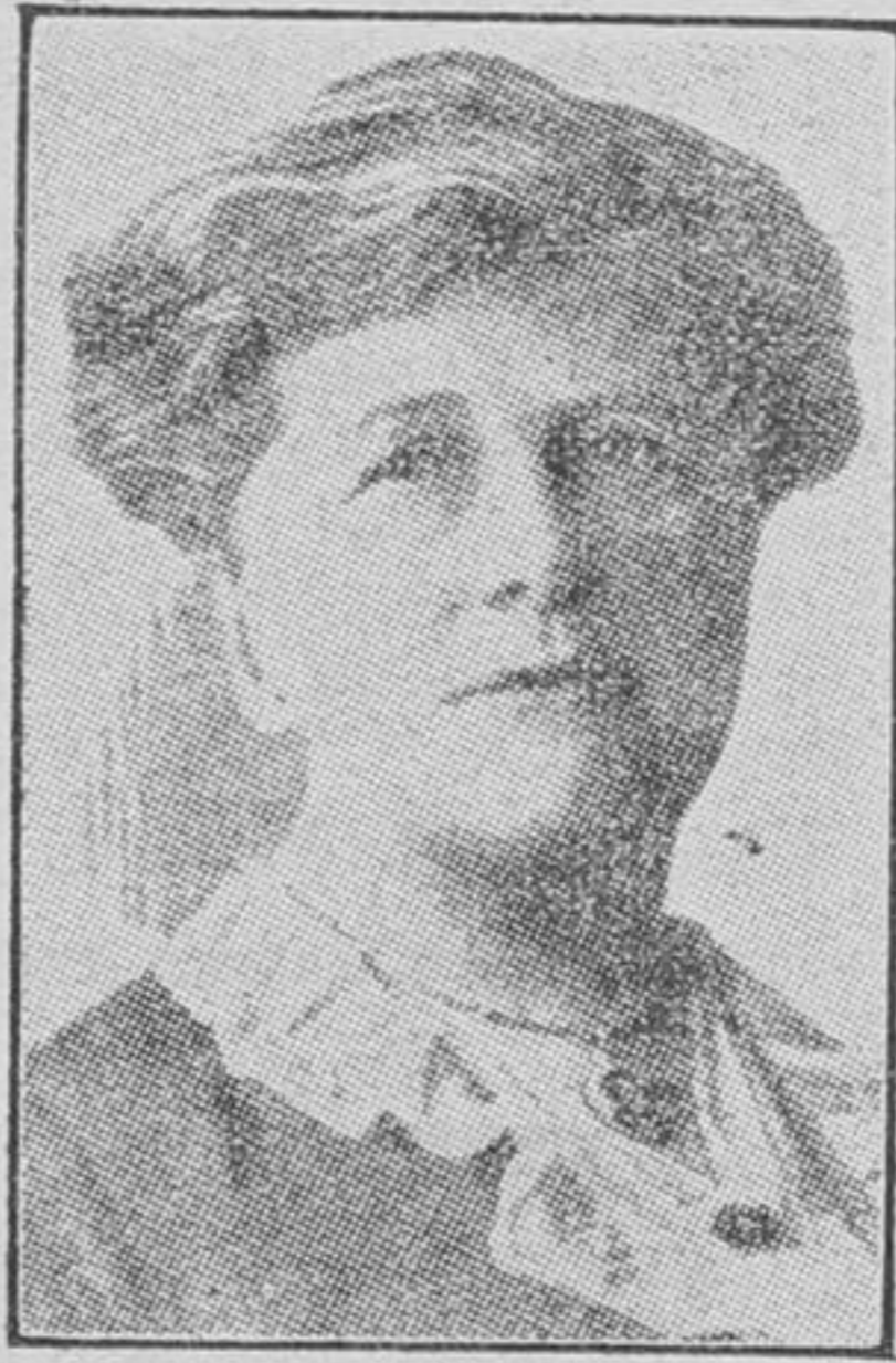
Raises Big Constitutional Question Viscountess Rhondda, famous business woman, who asks that she be allowed to take her seat in the House of Lords as "a peeress of the realm."

A certificate from the Minister of Mines is to be accepted as evidence of conditions governing wage adjustment.