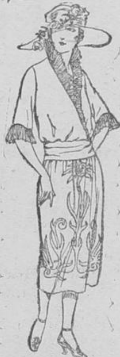
9459 Embroidery Pattern No. 1032

9459—Ladies' Dress (surplice closing, two styles of sleeve; two-piece skirt with or without peplum, 37 or 35-inch length from waistline). Price, 25 cents. In 7 sizes, 34 to 46 ins. bust measure. Size 36 requires 4 1/4 yds. 40 ins. wide. Width around the bottom, 1 1/2 yds.