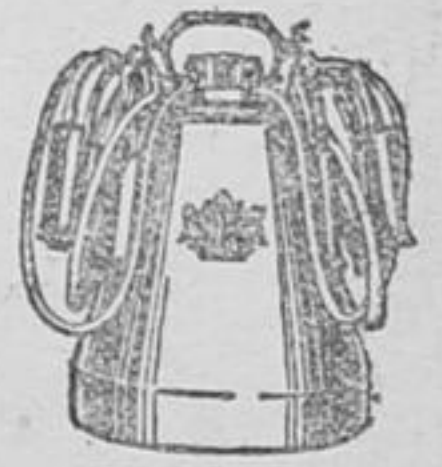
The Cow's Adopted Child

Besides being so simple, the Macartney Milker is perfectly natural in operation, there is nothing about it to irritate the cow, in fact its use is greatly preferable to the old method. Hand milking at best is only poor imitation of the calf's way of taking the milk. The Macartney Machine milks exactly as the calf sucks—that's why it is called "The Cow's adopted child."